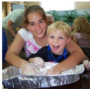
Having fun at Vacation Bible School.