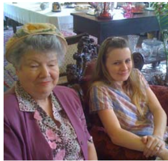
Enjoying each other's company at the Ladies Afternoon Tea.

People may enter our doors as guests, but they quickly find a warm welcome and begin to form close relationships. These relationships embody Christ's love, showing acceptance and holding one another accountable. In the process, our faith is shaped and changed. While faith-forming relationships encompass all ages and places in life, our youth and senior ministries are prime examples at First United Methodist Church.