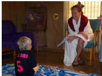
Teaching the Bible story at Vacation Bible School.

Through prayer we grow closer to God. Through study we grow as Christians. These two practices have been hallmarks of Methodists since the days of John Wesley, founder of the people called Methodists. It is through these means of grace that we grow in our love and knowl-