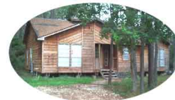
The Cramer Retreat Center is an oasis in the city. This conference resource is available for retreats and low-cost housing.

United Methodists are connected to one another. This means that local congregations are related to one another throughout a district, annual conference, jurisdiction, and the entire denomination. When you are part of a local United Methodist church, you are connected to other United Methodists throughout the world. We are global church with United Methodist congregations in North America, Africa, Asia, Europe and beyond. Through our connectional ministries, we touch the lives of people beyond