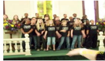
The Jefferson Elementary School Choir sings at the 165th anniversary service.

Worship is the way that many of us enter the church. It touches our hearts, feeds our souls, and helps bring God's love into our church and our lives. Worship at First United Methodist Church is centered on hearing God's word proclaimed, praising God for all