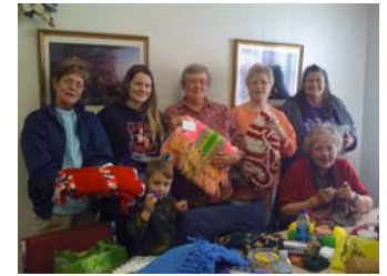
Our Prayer Shawl Ministry with the fruits of their labors.

Approximately 13% of our annual budget for a total amount of $19,141 goes to support study and prayer at First United Methodist Church.