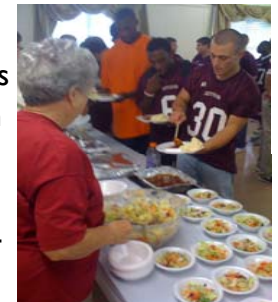
Serving Jefferson High School dinner before home games

Christianity is the one movement in the world that exists primarily for those who are not its members. Scripture compels us to welcome the stranger and embrace him or her as Christ has embraced us. Hospitality ministries at First United Methodist Church reach out to the community, inviting our neighbors to come and meet God here, and prepare us and our campus to welcome whomever accepts God's invitation.