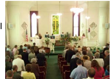
Easter Sunday at First UMC

God's blessings in our lives, and gaining strength for the week ahead. Our worship features a vibrant music ministry led by our gifted Music Director and growing chancel choir, challenging preaching that encourages growth in knowledge and love of God, and active participation by all ages. Approximately 39% of our annual budget for a total amount of $55,382 goes to support worship at First United Methodist Church.