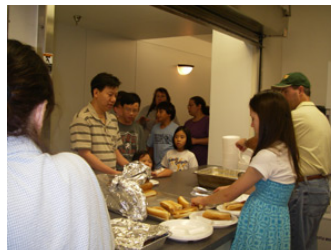
Serving Hurricane Ike evacuees in the Texas Annual Conference.

our community. In Texas, our connectional ministry helps plant new churches and revitalize existing ones. We saw the connection in action last year when Hurricane Ike devastated coastal areas of the Texas Annual Conference. Through connectional ministry, the entire world is our mission field. Approximately 10% of