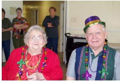
Guests at Care & Share, a monthly meal offered to residents at area nursing homes and assisted living.

These ministries include our outreach efforts through advertising, our website, and events like Books Alive and the Pumpkin Patch. Also included is our Transformation ministries, working to update our facilities and provide training for members in welcoming guests. In 2007 these ministries bore fruit when we were officially certified as a Welcoming Congregation in the United Methodist Church. Approximately 9% of our annual budget for a total amount of $12,357 goes to support hospitality at First United Methodist Church.