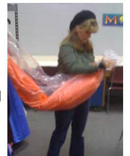
Wrapping up a dress for a young lady as part of Cinderella's Closet.

outreach to residents in area nursing homes. In 2008 we started Cinderella's Closet, our prom dress ministry, which continued in 2009. And in 2009 we planted a community garden that promises to help folks eat healthier. Approximately 13% of our annual budget for a total amount of $18,641 goes to support risk-taking mission at First United Methodist Church.